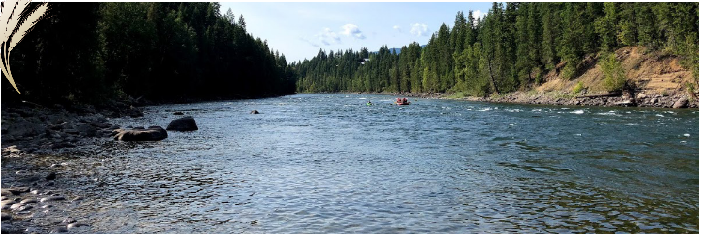
Clearwater River • Photo Credit: Stefanie Poisson

We look forward to seeing you and having you show us and YOUR Community you want to help protect this awesome place we love to live, work and play in!